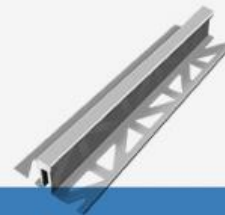
Stainless Steel Trim